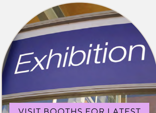
VISIT BOOTHS FOR LATEST RISK MANAGEMENT SERVICES / TOOLS