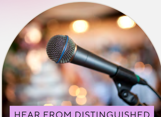
HEAR FROM DISTINGUISHED SPEAKERS & LEADING PRACTITIONERS