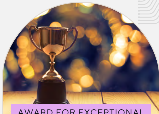
AWARD FOR EXCEPTIONAL RISK MANAGEMENT PRACTICES