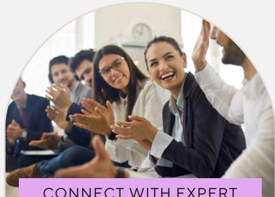
CONNECT WITH EXPERT RISK & INSURANCE PRACTITIONERS